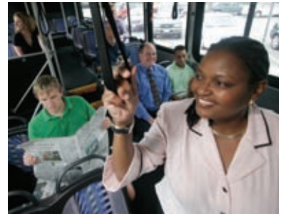
GRTC Everybody Rides

GRTC Capital Region Endowment/ Everybody Rides (2010) Provides transportation assistance to low-income populations served by Greater Richmond Transit Company (GRTC) in partnership with nonprofit and public organizations.