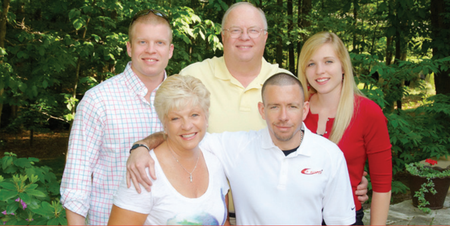
The McDaniel Family