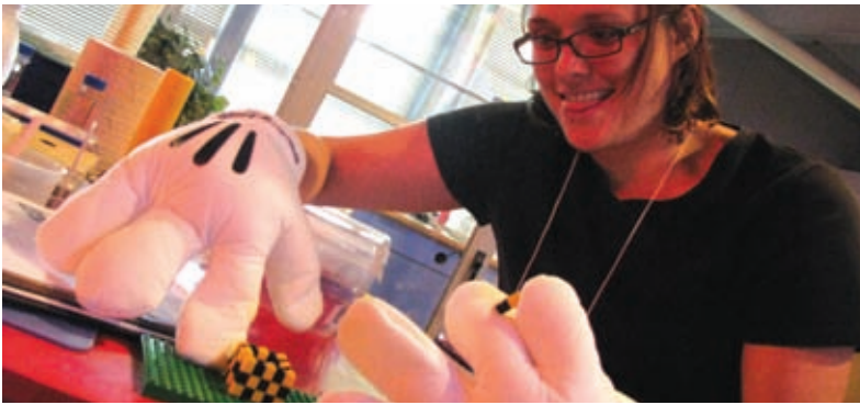
MathScience Innovation Center Endowment—Teacher demonstrates nanoscience